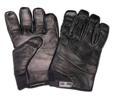
Hakson 201 Gloves

Hypodermic needle- and cut-resistant palm and fingertips. Slashresistant knit on back of hand. Outstanding dexerity with short breakin time. High-stretch knit backing for snug fit. Grip pads to assist in searches.