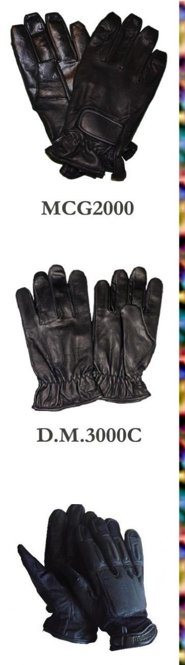
P & D 2004

Mix of Goatskin leather and fourway cloth Velcro wrist closure Comfortable and well-fitting Steel shots sewn into each glove. Steel shots sewn in the knuckles, defense for riots