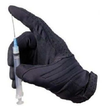
Puncture Resistance Gloves 202