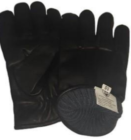
WOOL LINED GLOVES

WOOL LINING, COWHIDE LEATHER, ideal for low temperatures allowing sufficient dexterity for hand activities.