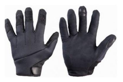
Puncture Resistance Gloves 203