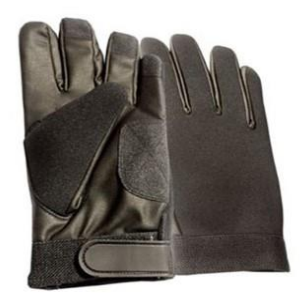
HK Armour Flex

Full Neoprene back 40 grams of Thinsulate lining SensiFeel synthetic leather palms SureGrip patches on palm and four fingers Great fit without the bulk Elastic cuff with Velcro closure